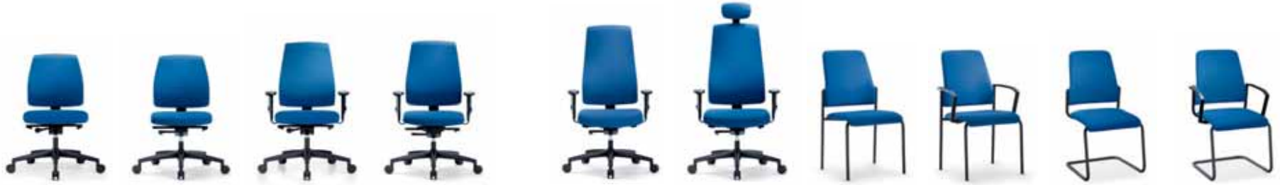
Visitor chairs / Conference chairs