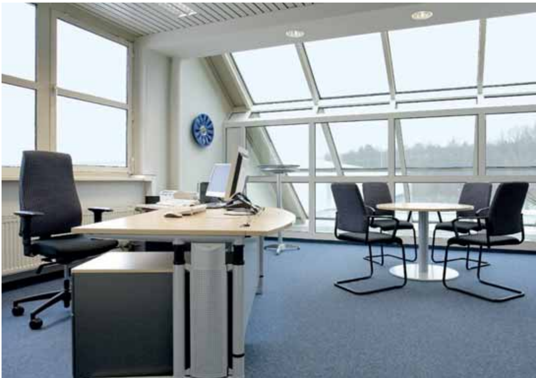
Goal, AUDI BKK, Neckarsulm